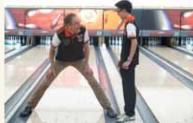
Which arrow do we look at?