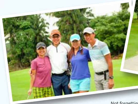
Not forgetting our players at Kranji