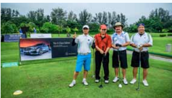
Let the games begin!