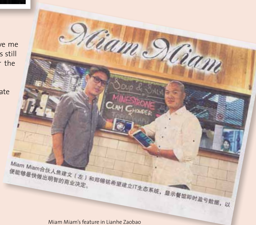
Miam Miam's feature in Lianhe Zaobao

Truly spoken like the busy businessman and passionate golfer that he is!