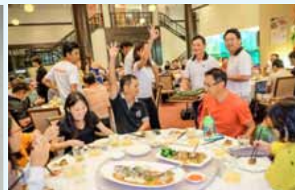
Many big hearted donors in the hall