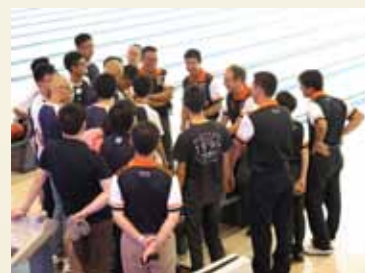
Getting ready to put that knowledge to practice on the lanes