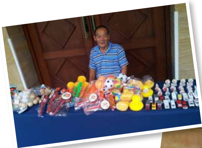
Classic children's toys!