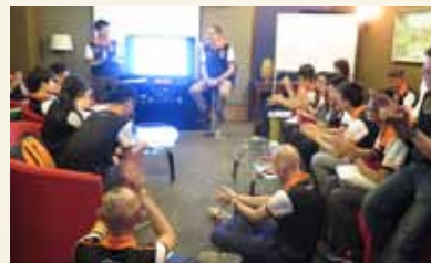
Question & Answer Time with the star of the show