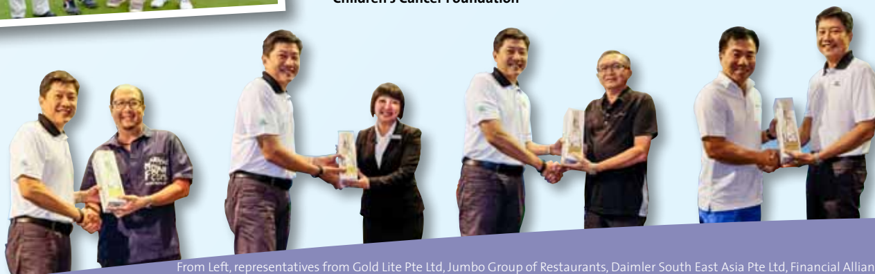
From Left, representatives from Gold Lite Pte Ltd, Jumbo Group of Restaurants, Daimler South East Asia Pte Ltd, Financial Alliance