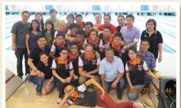
Group picture with our NSRCC bowlers & their parents