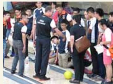
It's always good to learn about how to hit the pins