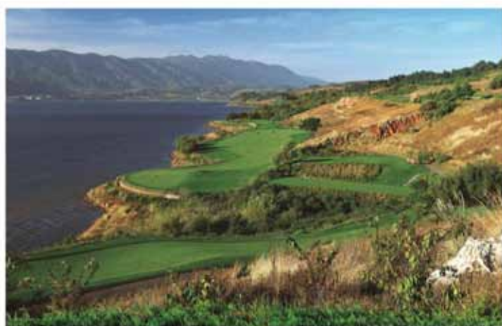
Spring City Golf & Lake Resort

Keppel Land Hospitality Management is pleased to offer members of NSRCC special rates at our award-winning courses.