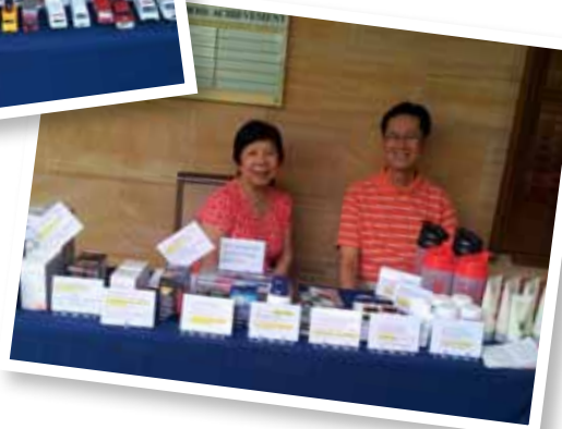
Health products set up during the Flea Market