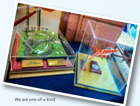
We are one-of-a-kind

“Our deepest gratitude for NSRCC’s generous donation to the Infant Jesus Homes and Children’s Centres (IJHCC). Donors like you provide the financial and moral support needed to continue our mission, to make a difference in the lives of children and youth whose deprived background in early life places them at risk.