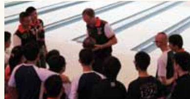
All about the bowling ball