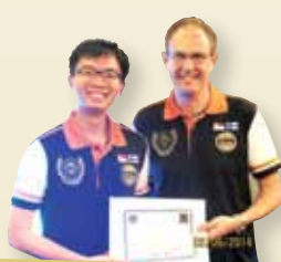
Giving out certificates to our bowlers