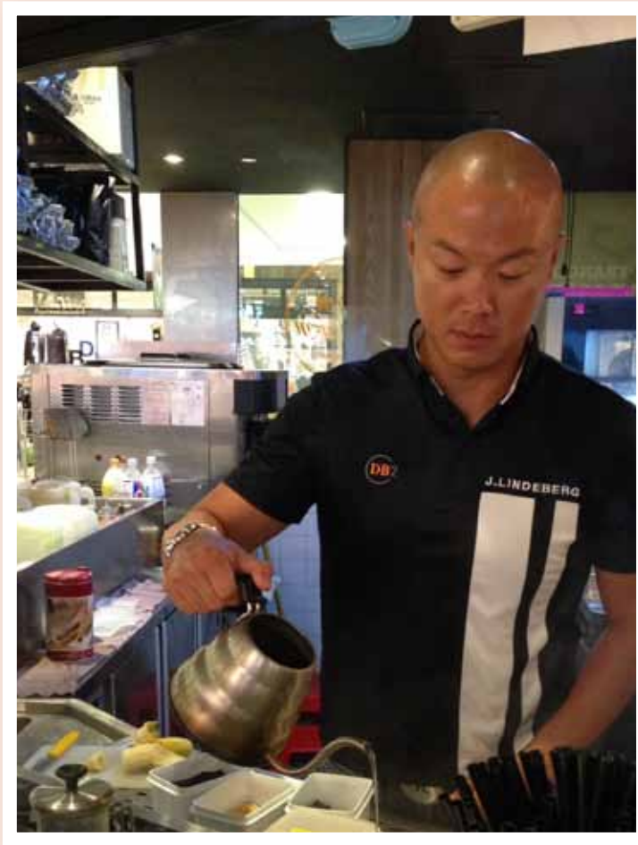
A little hard work goes a long way!