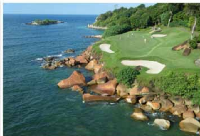
Ria Bintan Golf Club