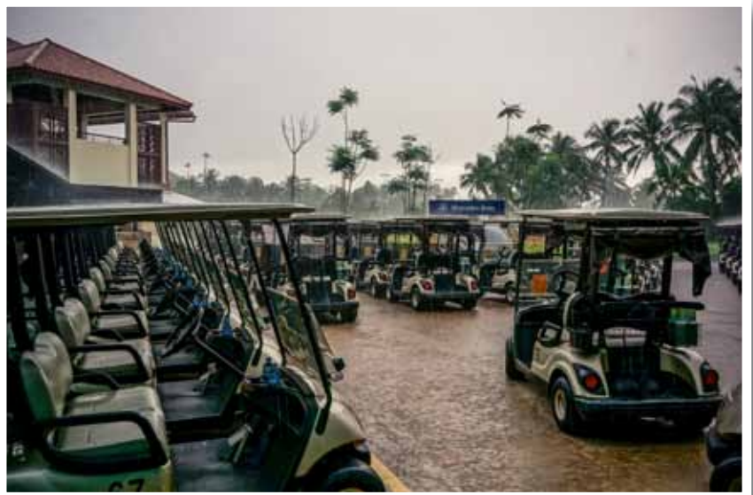
Gloomy skies and even a minor ponding

The Club is honoured to be able to play an active role in giving back to the needy within our community, and we would like to once again express our great appreciation to the many people who joined hands and collaborated as one to make this event a great success. Every effort and contribution will make a difference to the lives of our selected beneficiaries for 2014.