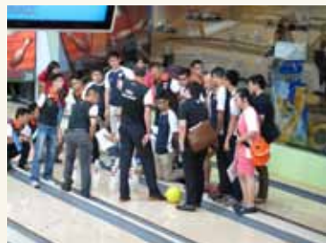
Now it's time to learn about pin position!