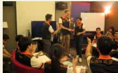
Time for a lucky draw