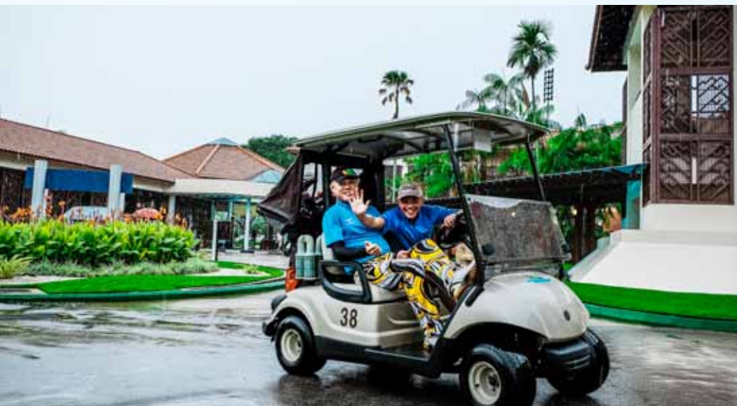
Big smiles after finally being able to enter the course