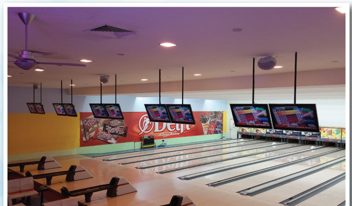
New speakers near bowling alleys