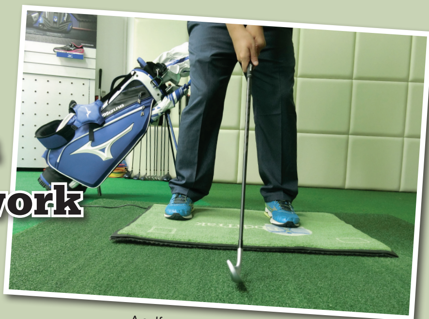
A golfer on the BodiTrak mat