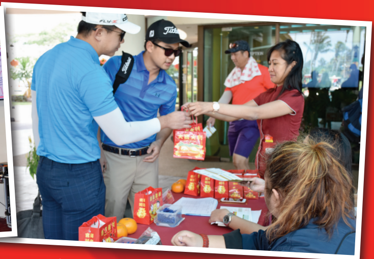
Golf CSO hands over oranges to participants