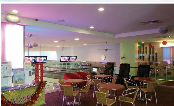
New speakers at concourse area

Visit our Resort Bowl to experience it for yourself!