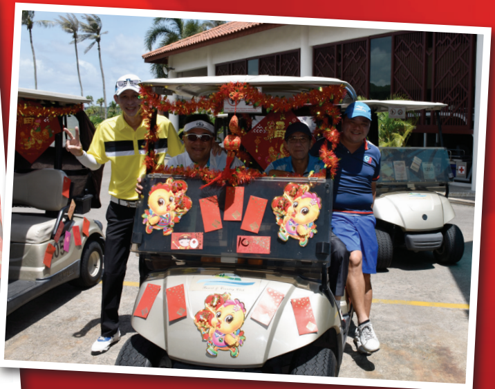
Posing on the festive buggy