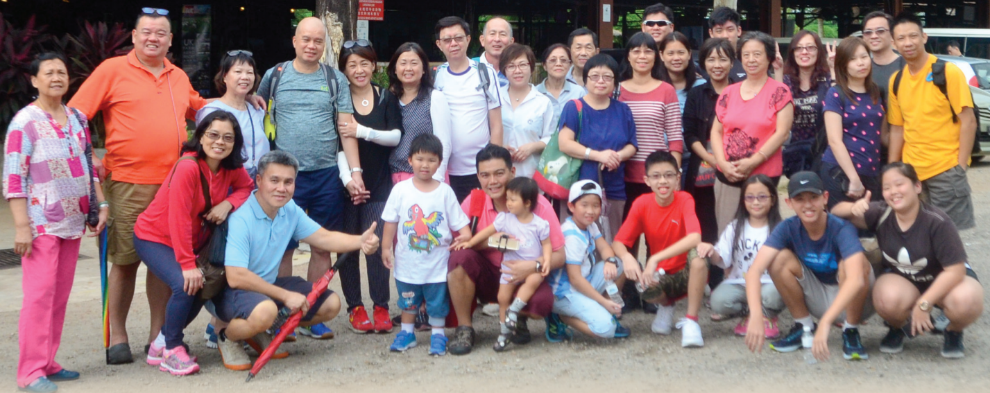
The happy participants of 1-day UK Farm Fun Tour in Kluang, Malaysia

More than 30 participants, including children, joined in a 1-day UK Farm Fun Tour organised by NSRCC on 10 December 2016. Most of them reached at least half an hour earlier than the reporting time, which really displayed their enthusiasm for the trip!