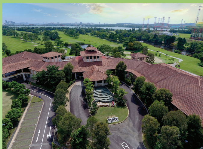
NSRCC Charity Golf 2017 13 th & 14 th May @ NSRCC Kranji

It would be good if we are more tolerant of each other on the golf course. An offer of sincere apologies would usually meet with equally sincere acceptance. This will