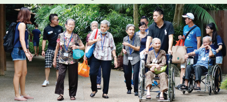
Moving together, looking out for one another