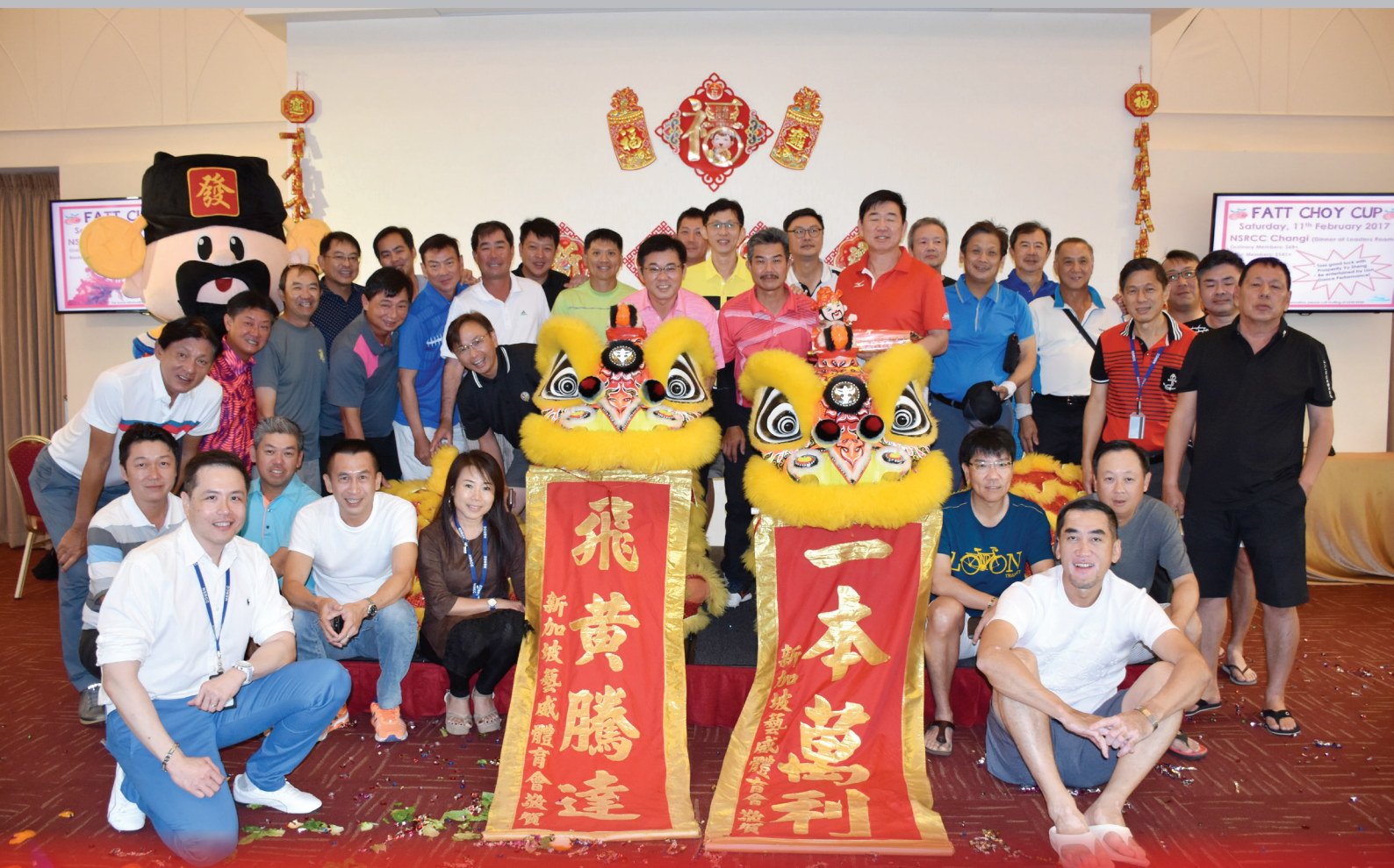
Fatt Choy Cup participants with Lion Dancers & God of Fortune