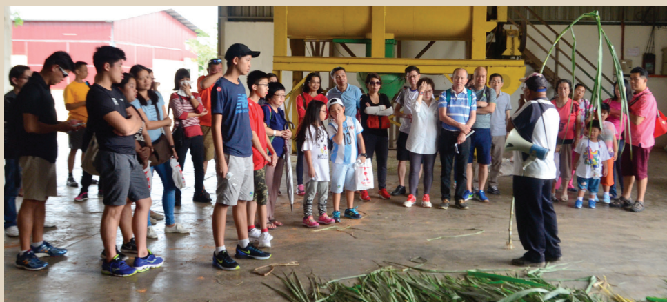
Guide explaining the process of producing feedstock

NSRCC is organising another 1-day trip to Malaysia, specifically Bekok Village, on 1 April! More details are provided in the event listing on page 25. For more information, please call 6540 8563.