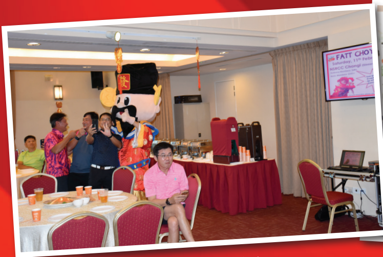
Selfie with God of Fortune