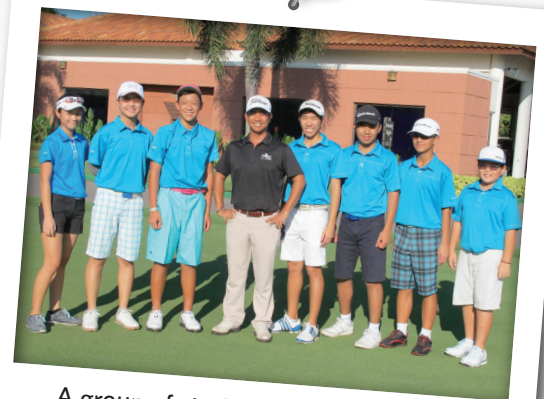
A group of students from the JGDP

All selected JGDP members will undergo training by the Club's resident golf academy, Phil Brew Golf Academy, with overall supervision by the Club's Greens Committee. Upon graduation at the end of each year, junior golfers who achieved a handicap of 8 or lower would be recommended to the Singapore Golf Association for its National Youth Team selection.