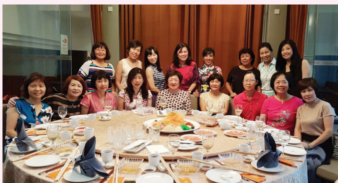
Let's take a picture first before tossing our "Lo Hei" for luck!

Chinese New Year is indeed a great time for celebration and bonding, to usher in the Lunar New Year! The lady golfers of our club celebrated the Year of the Rooster by combining the monthly Ladies Medal with a mini celebration thereafter.