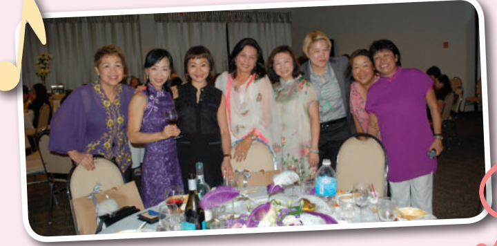
Some of the event sponsors